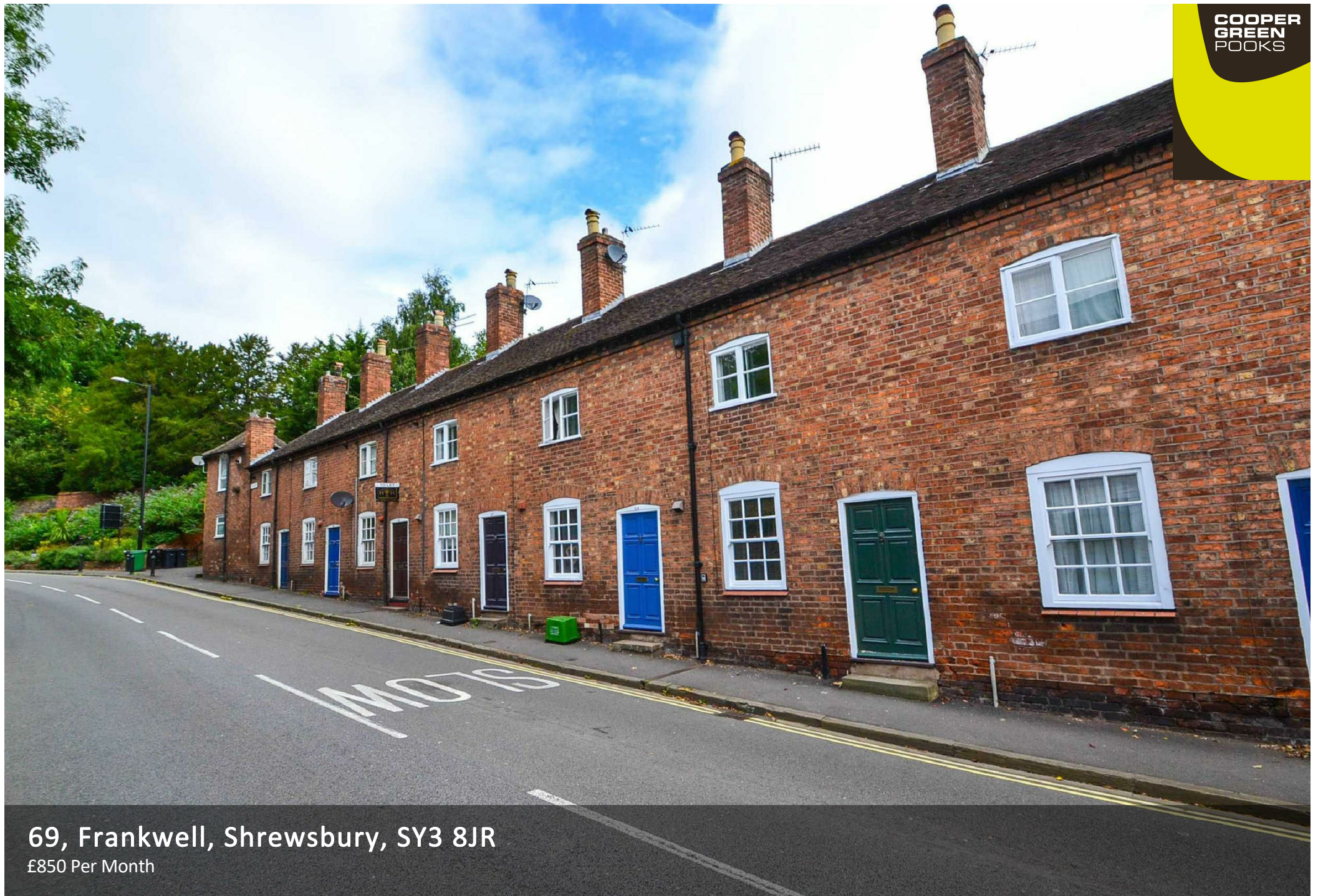
69, Frankwell, Shrewsbury, SY3 8JR £850 Per Month